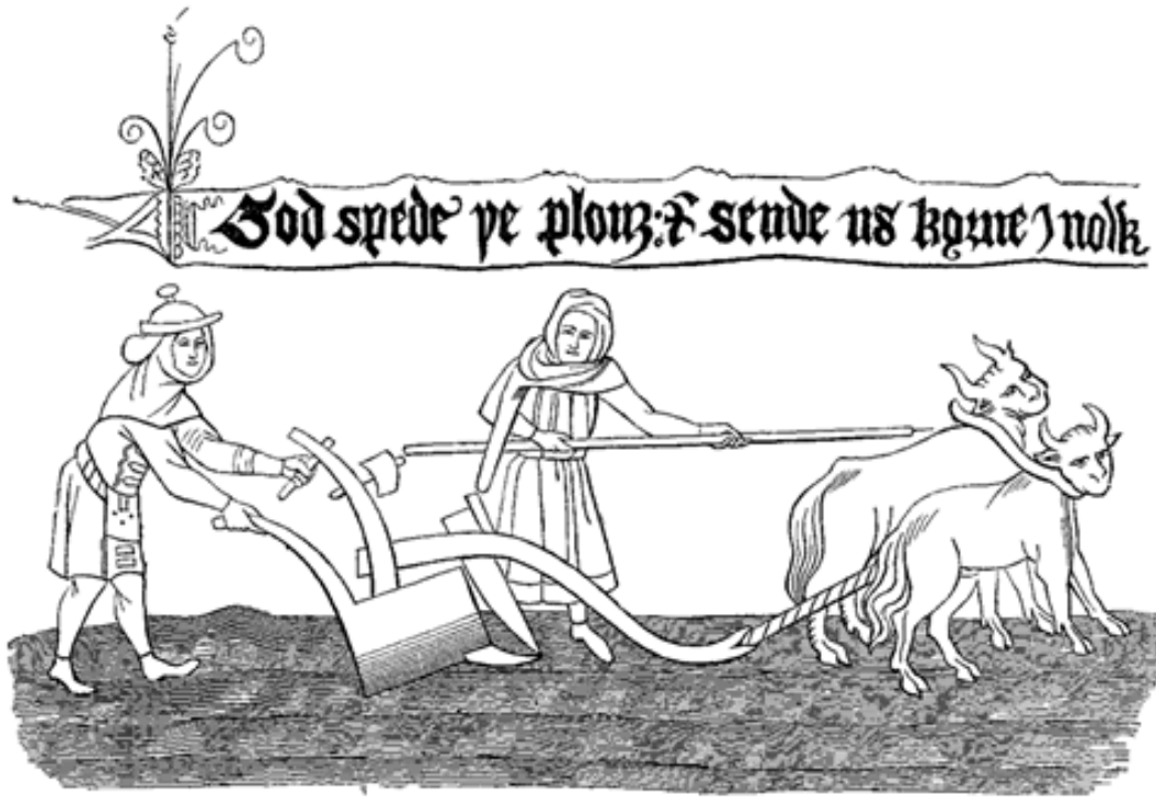
Fig. 18.—Ploughmen.—Fac-simile of a Miniature in a very ancient Anglo-Saxon Manuscript published by Shaw, with legend "God Spede ye Plough, and send us Korne enow."